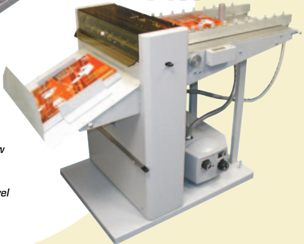
CREASE MATIC Auto50

The New British built Crease Matic Auto50 high speed card creaser is designed for higher volume digital printers and Litho printers, the new high speed SRA2 suction fed model is available at a price level normally associated with A3 models