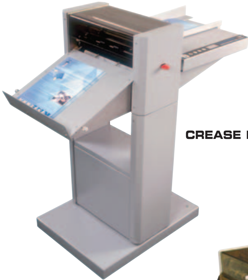
CREASE MATIC 150

The Crease Matic 150 is a fully programmable card creaser using a creasing rule and matrix style crease, this crease prevents toner cracking when folding digitally printed card.