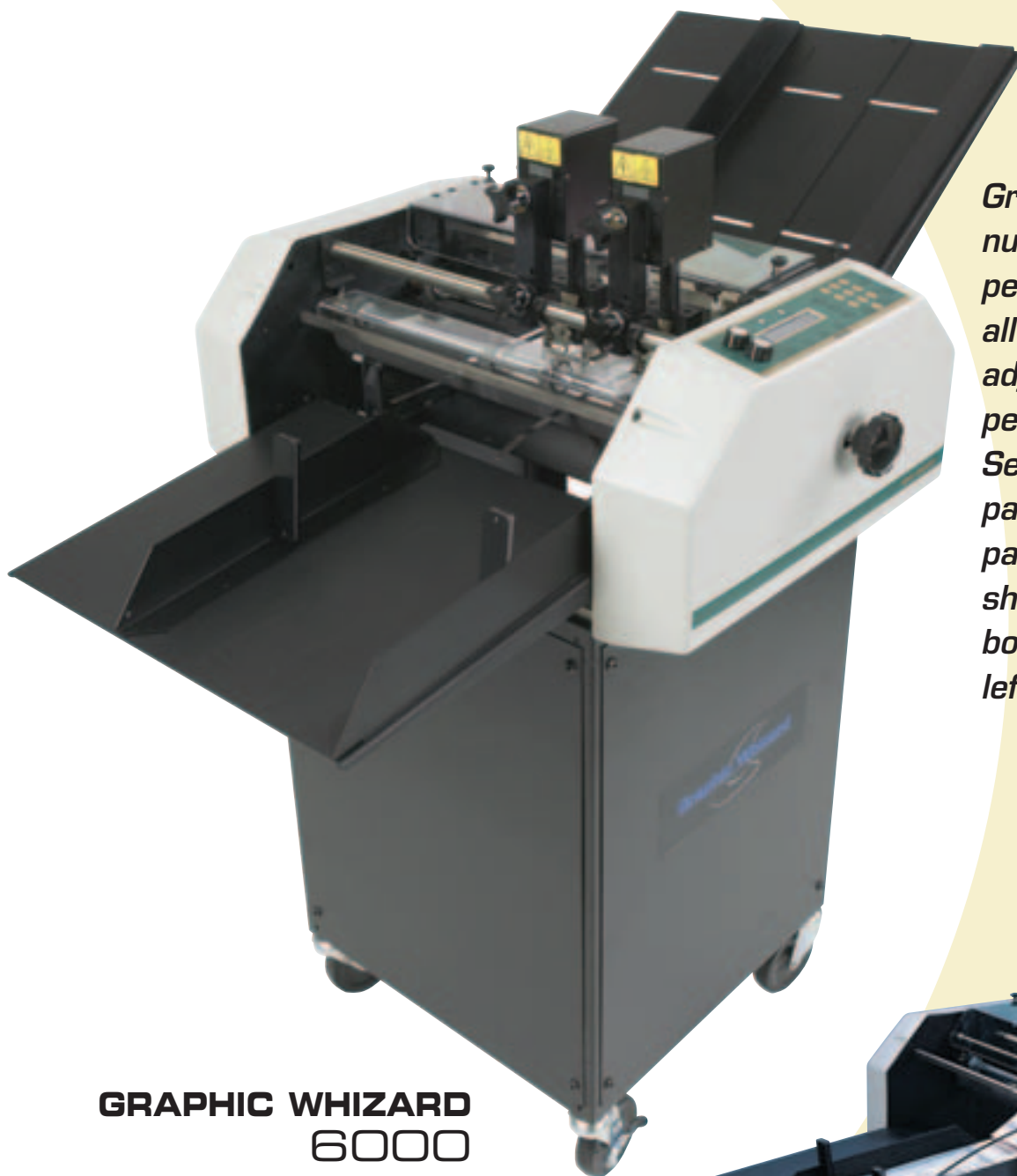
GRAPHIC WHIZARD 6000

Graphic Whizard numbering and perforating machines all feature the unique adjustable depth perf-score system. Sets can be part-perforated in one pass (ie 3 out of 4 sheets perforated), bottom fast sheet left unperforated.