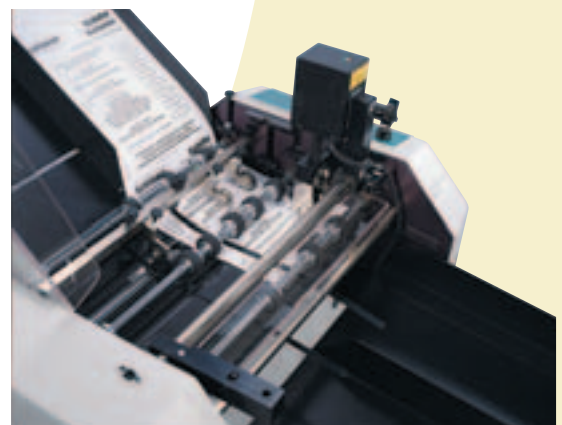
Adjustable depth perforating and scoring available on all models